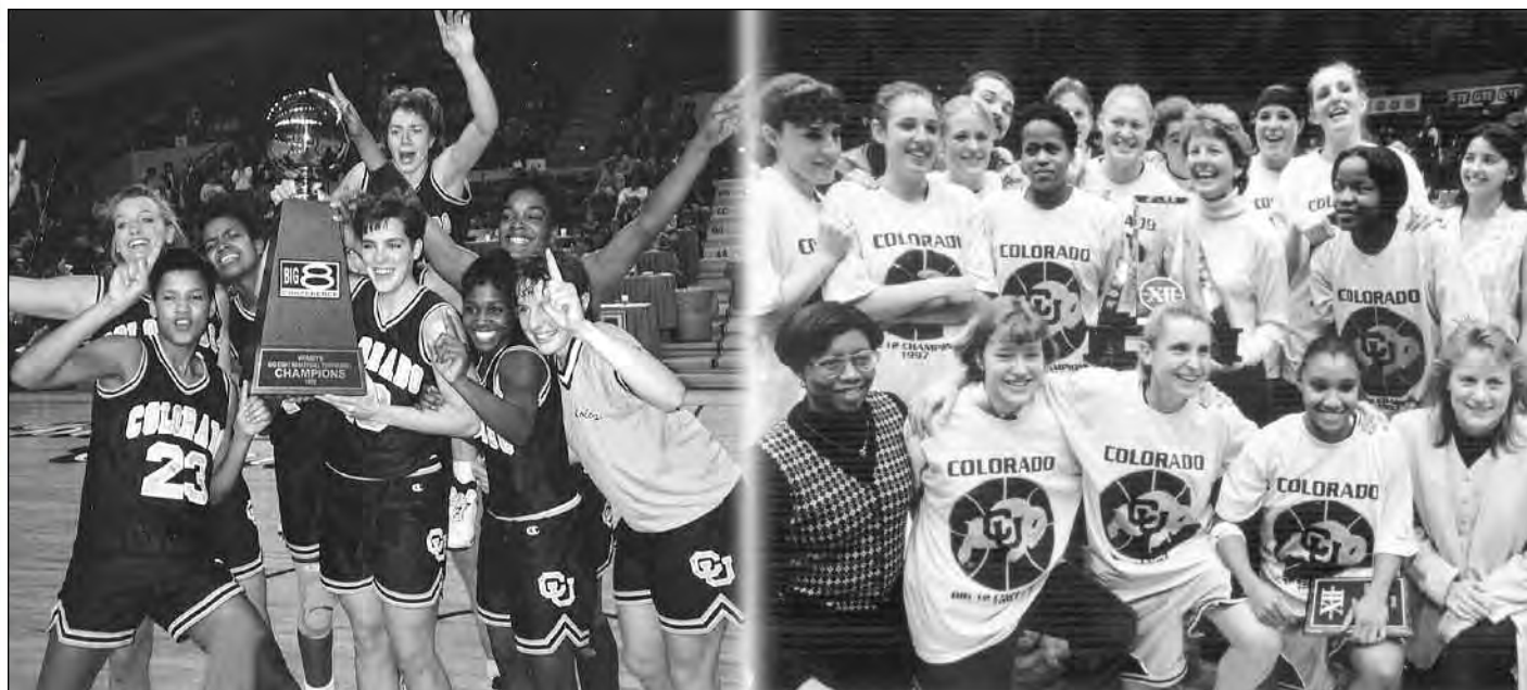
Colorado has five conference tournament titles in its history including the inaugural Big 12 Championship in 1997.

Game—4, vs. Nebraska, Feb. 9, 2000 Season High—18 in 1984 Season Low—2 in 2009 and 2010